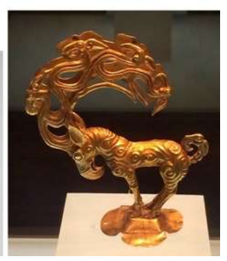
Fig. 4. On the left: Bull Statuette, Alacahoyuk, Turkey, Second Half of the III Millennium BCE.

In the middle: Statuette of Bronze Bull, Central Asia, Semirechye, VI-III BCE. Cast, chasing. 4x2,8x5 cm. Inventory Number: CA-3185.