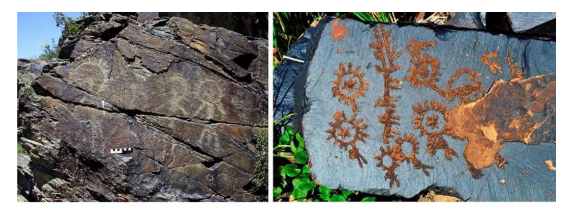
Fig. 1. On the left: "Sun-Head People" in Tamgaly-Tas Site, Almaty Region, Kazakhstan. Source: After (Rogozhinskiy 2019). Photo courtesy: V.A. Novozhenov. On the right: "Sun-Head People" in Saimaluu-Tash Site, Kyrgyzstan. Source: After (Petrov 2011). Photo: Ushakov and Tenkova, <u>www.photo.kg</u>

The images of the sun are done in various forms and styles: (1) the sun as a part of larger compositions, which also include figures of people performing rituals and dances, and animal figures; (2) the sun, which is "carried" by animals (deer, elk, horses, bulls) on their horns; (3) so-called "sun heads", or people with sun instead of their heads. The images of the so-called "sun-heads", or people with the sun instead of a head are one of the most striking types of representation of the sun found in Central Asia. (Fig. 1) These various representations are associated with the rituals and religious beliefs of people, being an important source for understanding the religious life in ancient times.