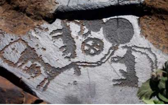
Fig. 2. On the left: Bronze Ceremonial Standard, Alacahöyük, Turkey, 2nd half of III millennium BCE. Source: The Museum of Anatolian Civilizations, Ankara, Turkey. Photo: Bjørn C. Tørrissen, CC BY-SA 3.0, On the right: Sun on the "Horned" Horse, Saimaluu-Tash, Kyrgyszstan. Source: After (Petrov 2011). Photo: Ushakov and Tenkova