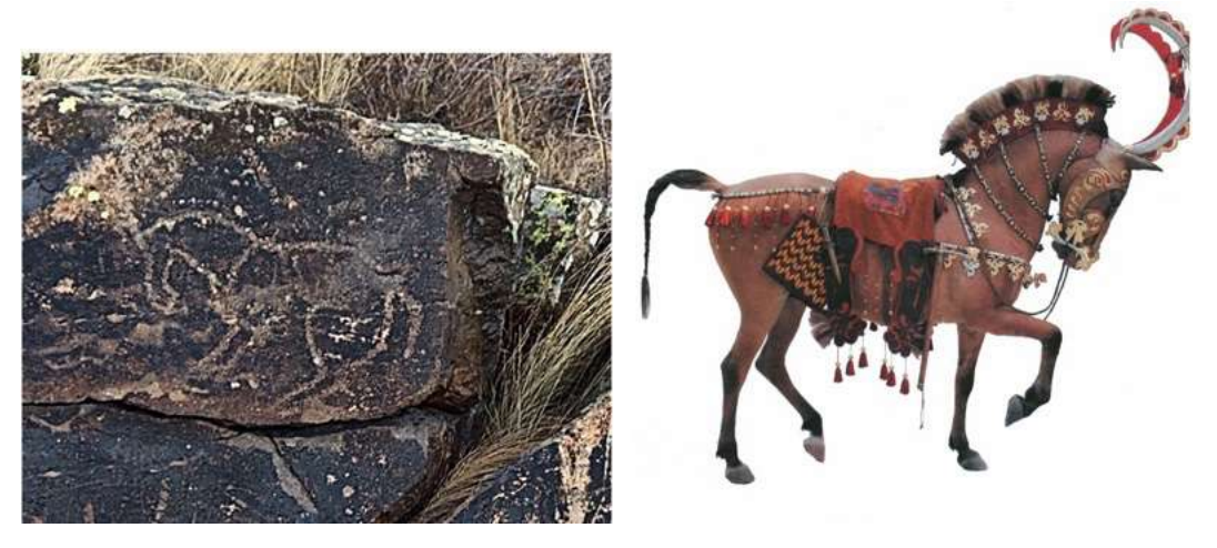
Fig. 3. On the left: Image of a "horned" horse, Konyrzhon, Karkaraly district (Central Kazakhstan), first half - third quarter of the II millennium BCE. Source: Photo author and courtesy Victor A. Novozhenov. On the right: Smart Decoration of the "Horned" Horse from Berel-11 Burial Mound, Eastern Kazakhstan, Saka Period, IV-III BCE. Source: Photo and reconstruction Krym Altynbekov. Photo courtesy Napil Bazylkhan.

On one of the vertical stone slabs found in Central Kazakhstan, of which most of them are turned to the east, there is a depiction of a horse with large backward-curved horns (Fig. 3, left). The horse is filled with dynamism and inner energy and is part of a large stone triptych. According to scholars, this image refers to the early nomadic period, when the "horned" horse was a symbol of the sun and sky, and the "simple" horse (without horns) was considered the main element of the economic life of the steppes of antiquity (Bedelbayeva, Novozhenov and Novozhenova 2015:49, 51).