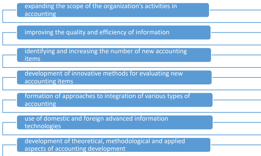
Fig.3. Some areas of development of accounting methodology

accounting objects, which are intellectual human capital, customer base, innovative products, etc. [8] It is observed that non-financial information is included in the accounting system (the quality of the client base, the state or implementation of social responsibility, the presence of economic security risks, the degree of use of energy-saving technologies, etc.). There are modern developments of new information technologies, such as cloud technologies, open technology platforms, electronic reference and information systems, and the creation of a single international format and content of financial statements in electronic form.