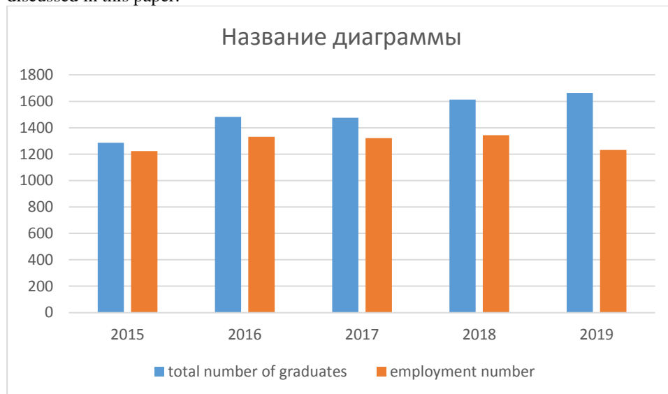
Fig 2. Graduate employment in Master's degree programmes (developed by authors based on obtained results from Career Centre, al-Farabi KazNU).

As it is shown in the figure 1. the percentage of employment for graduates of bachelor's degree programme is rather low than postgraduate education. The reason for this tendency stems from lack of practice-oriented experience and professional competencies and skills of students to be recruited by potential employers. Analyzing the obtained data for graduate employment of bachelor's degree programmes for the last five years, the percentage is 78 percent. Acknowledging the fact that main indicators of quality education and productive performance of universities is successful employment of graduates, a national university has introduced some strategical programmes and mechanisms to fight with this current issue to be discussed in this paper.