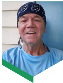
John Michael Weber Open Door Mission in Houston Texas, United States