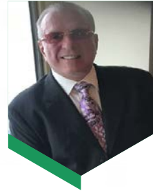
John Giordano Life Enhancement Recovery Center, United States