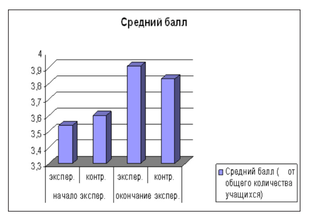
Figure 1: Level of exchange

the textbook, the handbook of the necessary information, but also the answer to the question, the definition, the rule, an example of a physical phenomenon. Has received a confirmation that pictures placed in a parable can be used and not only as illustrations explaining the meaning of a physical phenomenon or the law of nature, but also as a means of developing speech, observation, logic, thinking, and purity. Testimonies to this - the manifestation at the joys of jelly to think up a picture of the problem, in order to reproduce the physical phenomenon, to figure out, to create