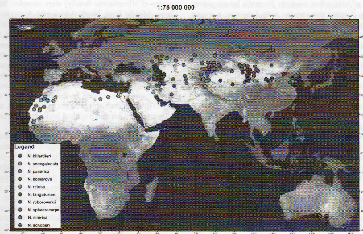
Figure 1 – Distribution of the Nitraria in the World

Initially Komarov (1908) proposed two predictions about its center of origin. First, it would be Gondwana. Nitraria grows in Australia and Africa, but it does not exist in the Indian subcontinent, Madagascar and South Africa. Its absence in the Indian subcontinent is especially indicative. Second, it would be Angara continent. In general, it's poor not only with Nitraria , but also with its relatives. Moreover, Malpighiaceae and Zygophyllaceae do not have the original types here, which would have prevented them here generally considered by later invaders. Finally, he thought that Nitraria is the origin of tropical and western and penetrated into Mongolia via the Aral-Caspian basin as it is drying up. The habitat of Nitraria in Australia was explained only by assuming the hypothesis that the plant in its history was connected with the continent of Gondwana, unless, of course, as it was a random element.