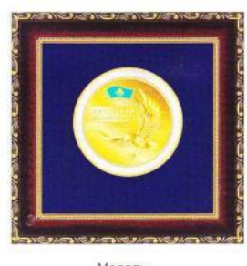
Медаль «ЛИДЕР КАЗАХСТАНА 2013»