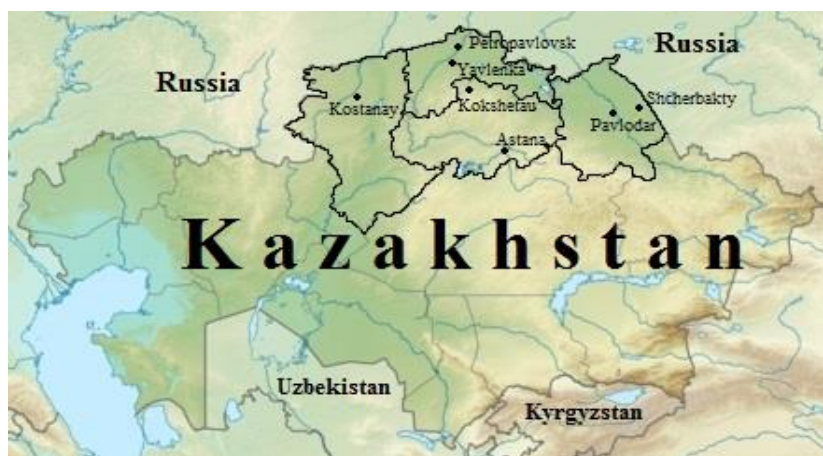
Figure 1. The Territory of Northern Kazakhstan.