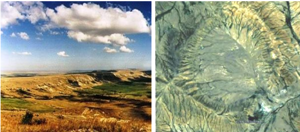
Fig. 1: General view of the modern relief of Shunak and Zhamanshin craters. LANDSAT space images

Especially differences are observed in the structure of the ring shaft. The integrity of the annular shaft crater Zhamanshin is broken. It is represented by a system of multi-height steep slopes of crest, ridges, hills formed as a result of erosion, gravity-slope processes. This was facilitated by the composition of rocks, their influence on the intensity of the development of exomorphogenesis processes. The ring shaft of the crater is distinguished by a complex lithologic-stratigraphic complex. In the geological section of the shaft, two parts are clearly expressed. The lower part consists of fragments of Paleogene, Cretaceous and Paleozoic rocks that overlap the undisturbed Paleogene rocks. The upper part of the annular shaft (Coptogenic complex) includes allogenic breccia and impactites: irgizites, zhamanshites with fragments of Paleozoic rocks. The inhomogeneity of the lithological composition of the ring shaft has become the main factor of its intensive transformation, destruction (Izokh, 1990).