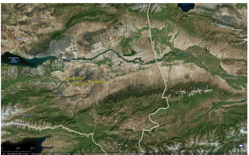
Picture 1 – Location map of studied population Ikonnikovia kaufmanniana

To study age structure, longitudinal transects were laid out at each studied site (Table 1). Discrete areas of 1 m2 (in total 30 areas) were laid out at intervals of 10-20 m depending on the location's relief. At each site, an inventory was made of all specimens of the same species with a breakdown by maturation state.