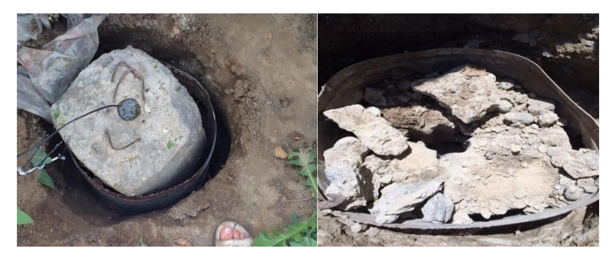
a) b) a) Monolithic concrete block, b) Monolithic concrete block is crushed by gas generator.

tests are summarized in diagram. The researches on concrete fragment distribution by closed armored shell were carried out (Figure 1a). The concrete fragment distribution doesn't observe (Fig. 1b).