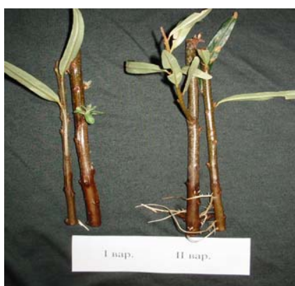
1 2 a

Experiments on rooting were carried out with Tamarix gracilis too. Results are presented in Figs. 4 and 5. It is necessary to note that the biostimulator causes formation of roots and also the formation of leaves. The given fact is distinctive feature of our new biostimulator. All other phytohormones have polarity of action. For example, auxine stimulates formation of only lateral roots and stops growth of leaves. Cytokinin stimulates growth of leaves, and growth of roots is not observed.