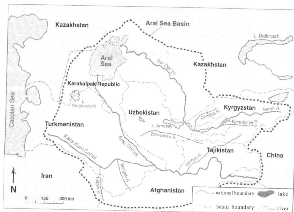
Figure 1 – Aral Sea basin [1]