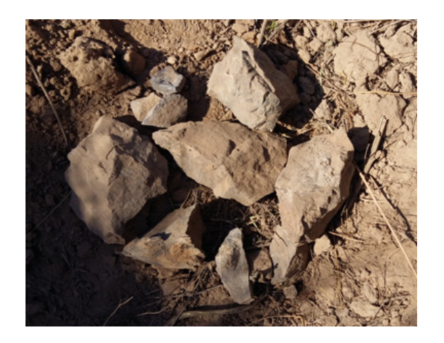
Fig.-3: The stone after combustion of the gas-generator composition

The gas-generating composition KClO<sub>3</sub>-72%, PE-17%, nano-aluminum Alex-11% for the destruction of stone was developed. The carried out researches and performed polygon researchers have shown high efficiency of application of this gas-generator composition for destruction of a stone.