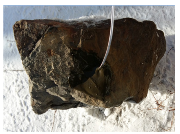
Fig.-2: A stone charged with a gas-generator charge

In polygon conditions, researchers on the destruction of a stone by initiation of a charge of gas-generating composition were carried out by an incandescence spiral (nichrome). The range of scattering of separate pieces of a stone was 2-3 m.