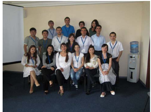
The participants of the summer school